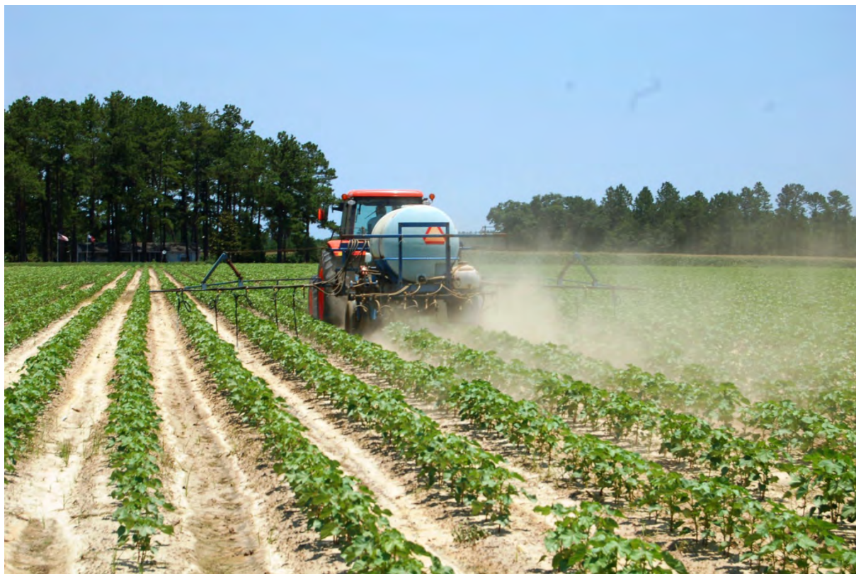
Side dress application cotton, June 2011