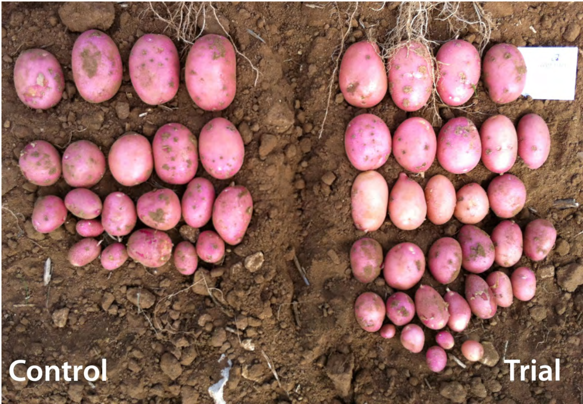
Potatoes, exhibition demonstration plot, Cereals 2011 conference, Lincolnshire, UK