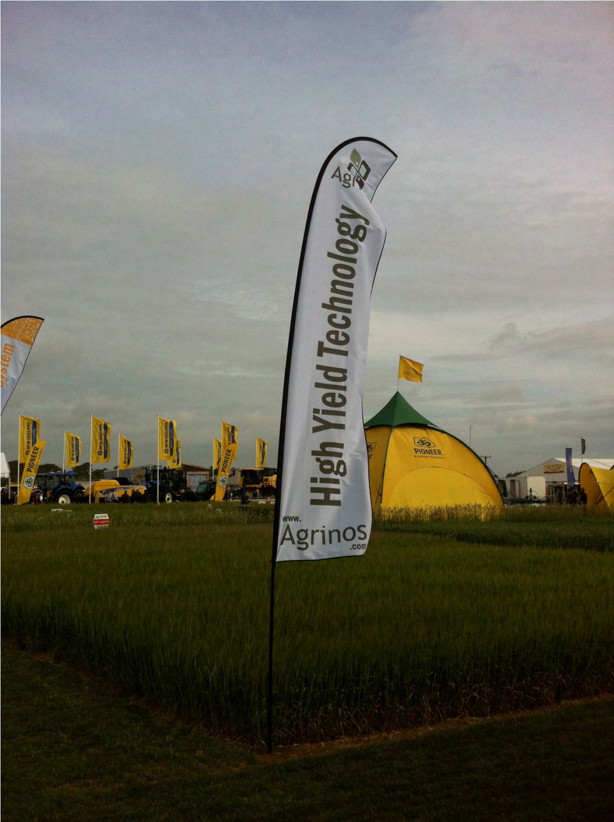
Cereals Event - technical event for the arable industry - in UK in June 2011