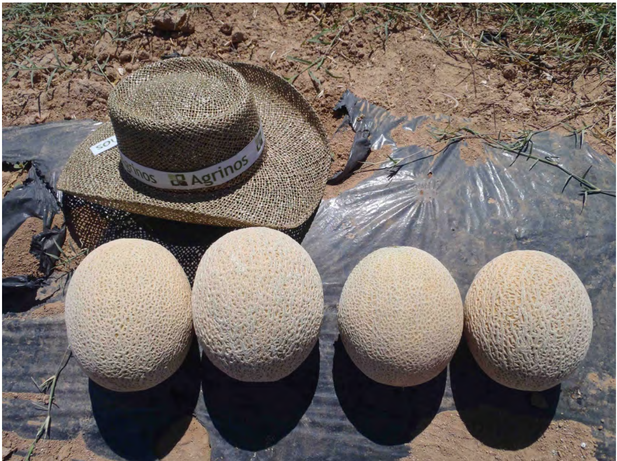
Cantaloupe melons, Arizona, 2011 – trials in association with internationally known fresh and canned food company