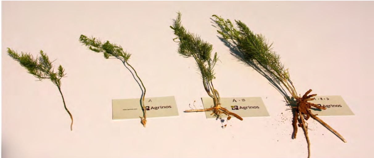
Asparagus, Baja California, Mexico, 2011