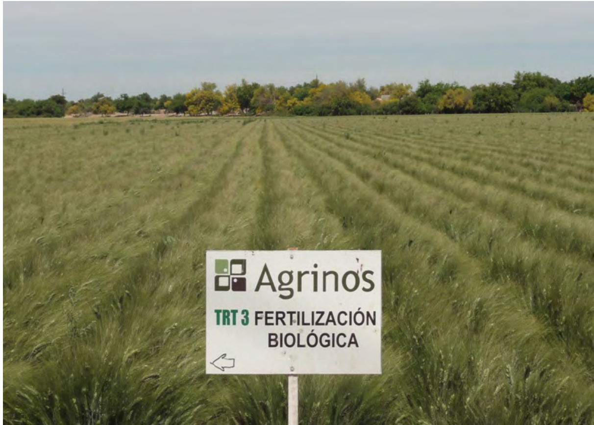
Durum wheat, Sonora, Mexico, 2011 – Trials performed on behalf of the Mexican Government under the supervision of CIMMYT (International Maize and Wheat Improvement Center)