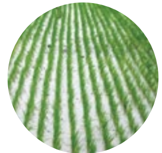
Treated with Agrinos products

TO LEARN MORE, VISIT OUR WEBSITE AT WWW.AGRINOS.COM